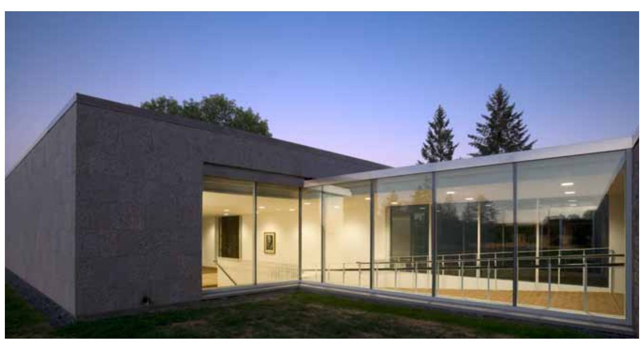
VJAA = St. John's Abbey and Monastery Chapter House and Chapel in Collegeville, Minn.